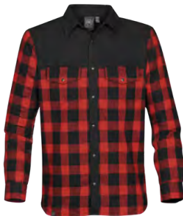
M'S & W'S: BLACK/RED PLAID