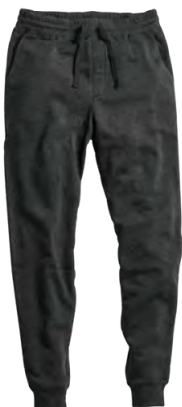
M'S & W'S: CARBON HEATHER