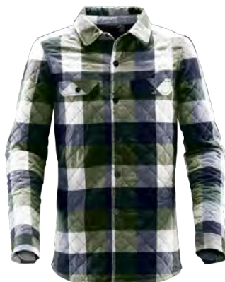
M'S & W'S: EARTH/NAVY