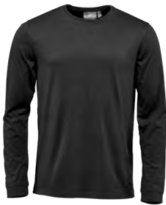
M'S & W'S: BLACK