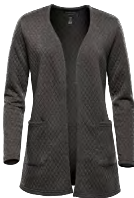
W'S: GRAPHITE HEATHER