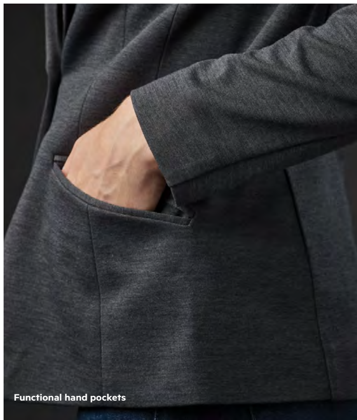
Functional hand pockets