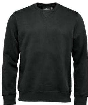
M'S &amp; W'S: BLACK