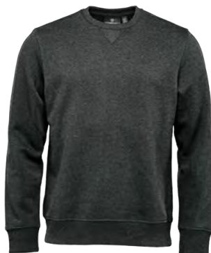
M'S &amp; W'S: CARBON HEATHER