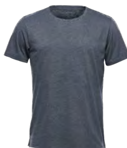
M'S & W'S: DENIM HEATHER