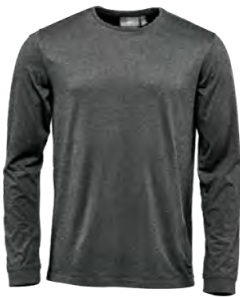
M'S & W'S: GRAPHITE HEATHER