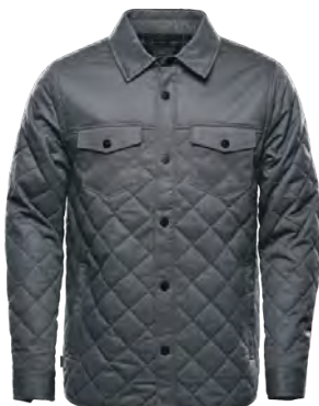
M'S & W'S: GRAPHITE