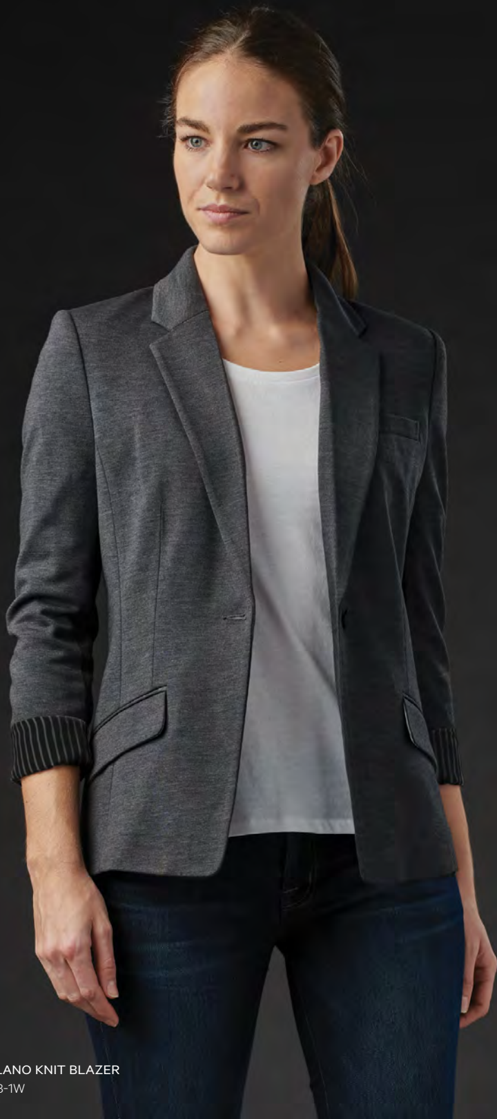
DELANO KNIT BLAZER KNB-1W

When it comes to female apparel, STORMTECH is devoted to producing functional, fashionable apparel with gender-specific designs, from the ground up. This is where STORMTECH's female-led design team comes in. STORMTECH is committed to creating female-first garments and very excited about our new and refreshing approach to our Women's styles.