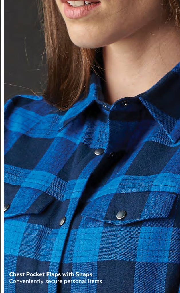
Chest Pocket Flaps with Snaps Conveniently secure personal items