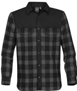
M'S & W'S: CARBON PLAID