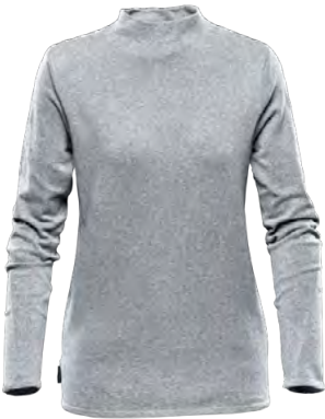
W'S: GREY HEATHER