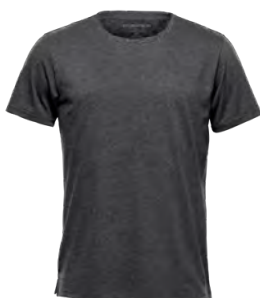
M'S & W'S: GRAPHITE HEATHER