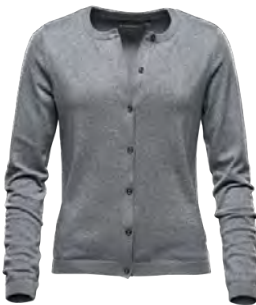
W'S: GREY HEATHER