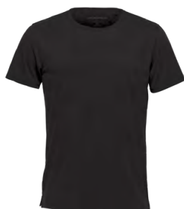
M'S & W'S: BLACK