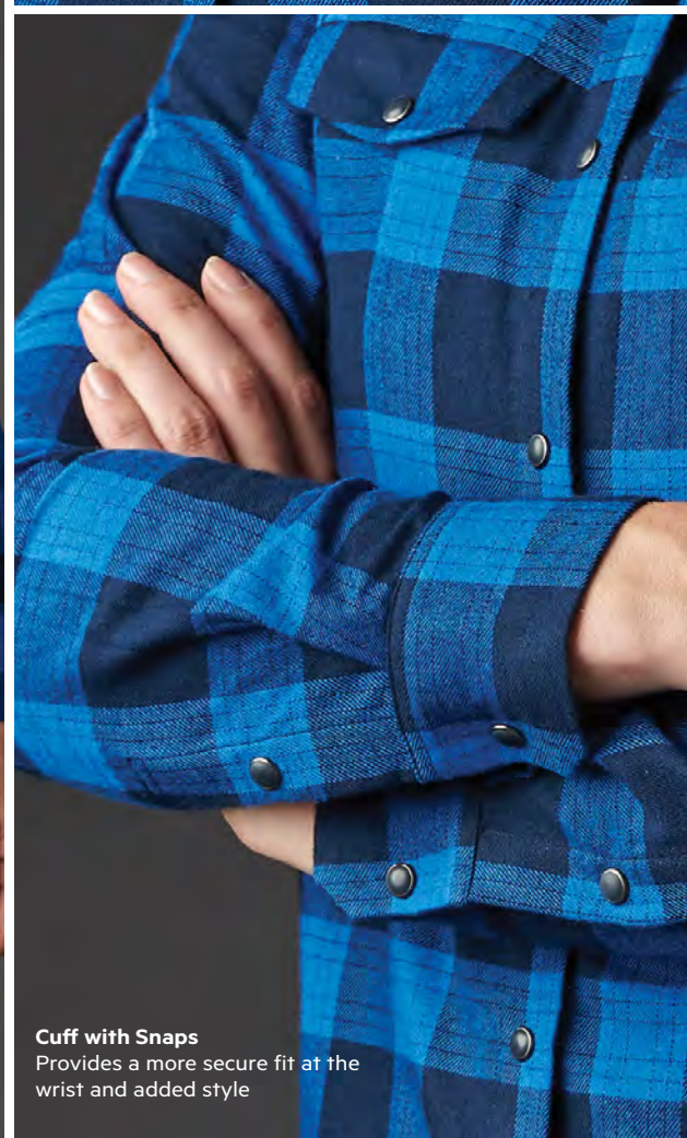
Cuff with Snaps Provides a more secure fit at the wrist and added style