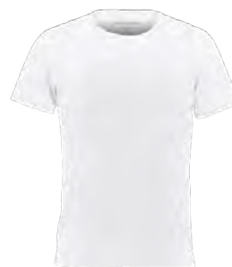
M'S & W'S: WHITE