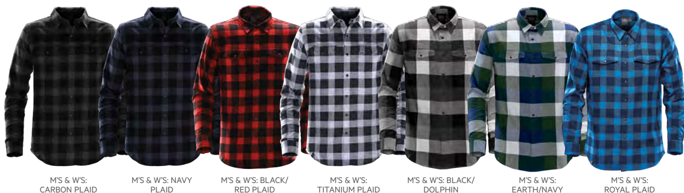
M'S & W'S: CARBON PLAID