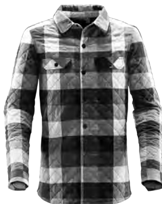
M'S & W'S: BLACK/DOLPHIN