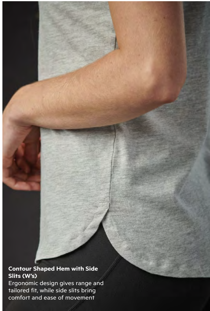
Contour Shaped Hem with Side Slits (W's) Ergonomic design gives range and tailored fit, while side slits bring comfort and ease of movement