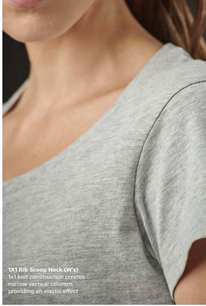
1X1 Rib Scoop Neck (W's) 1x1 knit construction creates narrow vertical columns providing an elastic effect