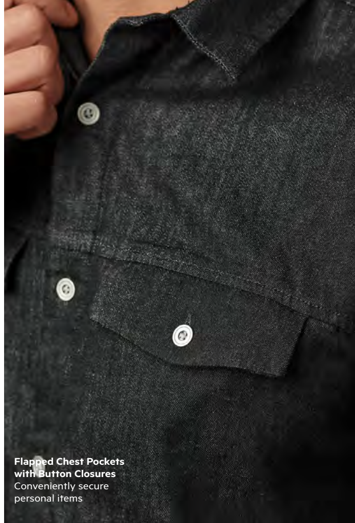
Flapped Chest Pockets with Button Closures Conveniently secure personal items