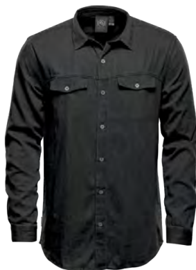
M'S &amp; W'S: BLACK