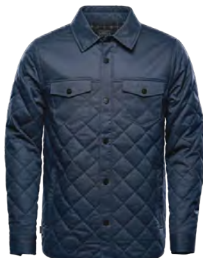
M'S & W'S: INDIGO