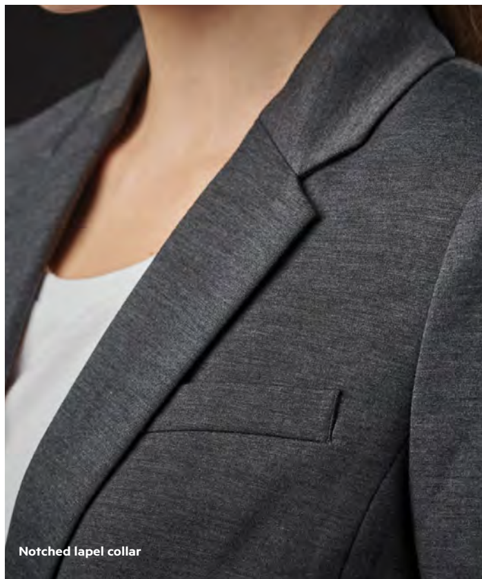
Notched lapel collar