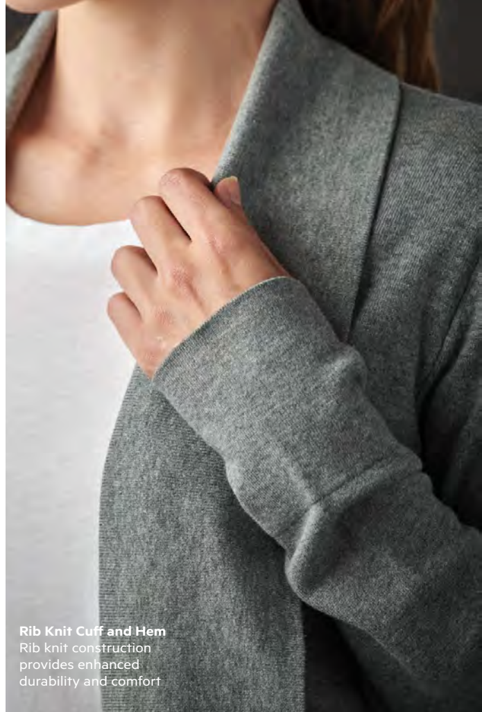
Rib Knit Cuff and Hem Rib knit construction provides enhanced durability and comfort