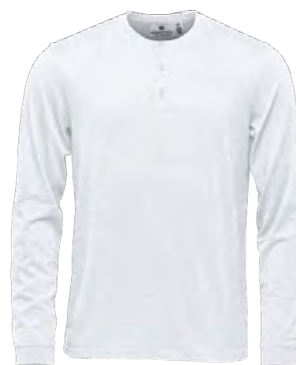
M'S &amp; W'S: WHITE