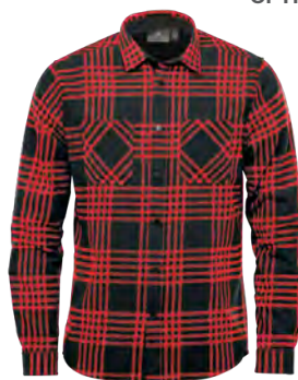
M'S &amp; W'S: RED/BLACK