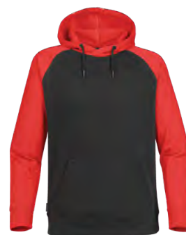
M'S: BLACK/BRIGHT RED