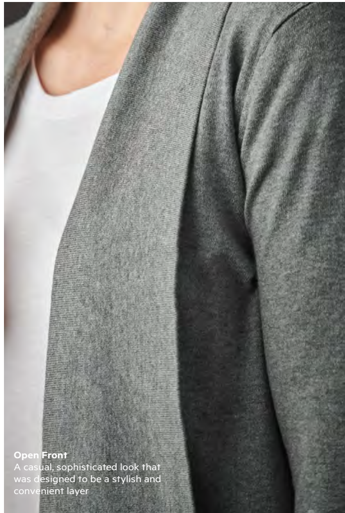
Open Front A casual, sophisticated look that was designed to be a stylish and convenient layer