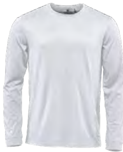
M'S & W'S: WHITE