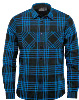
M'S &amp; W'S: BLUE/BLACK