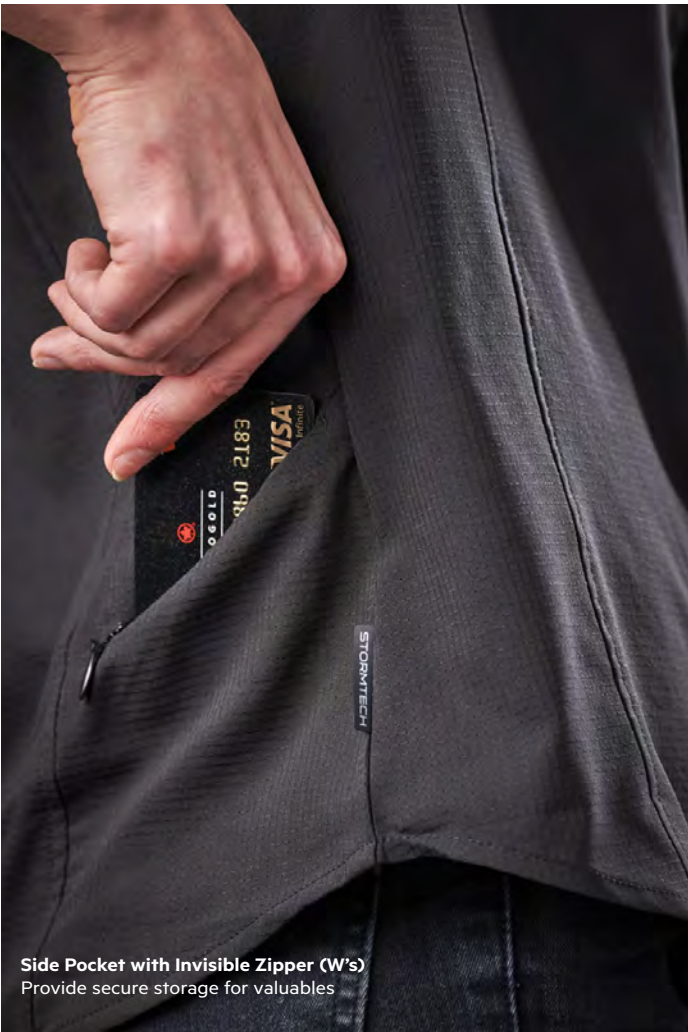
Side Pocket with Invisible Zipper (W's) Provide secure storage for valuables