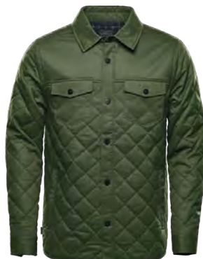
M'S & W'S: EARTH