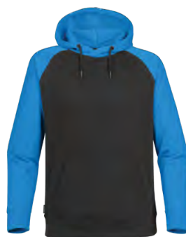
M'S: BLACK/ELECTRIC BLUE