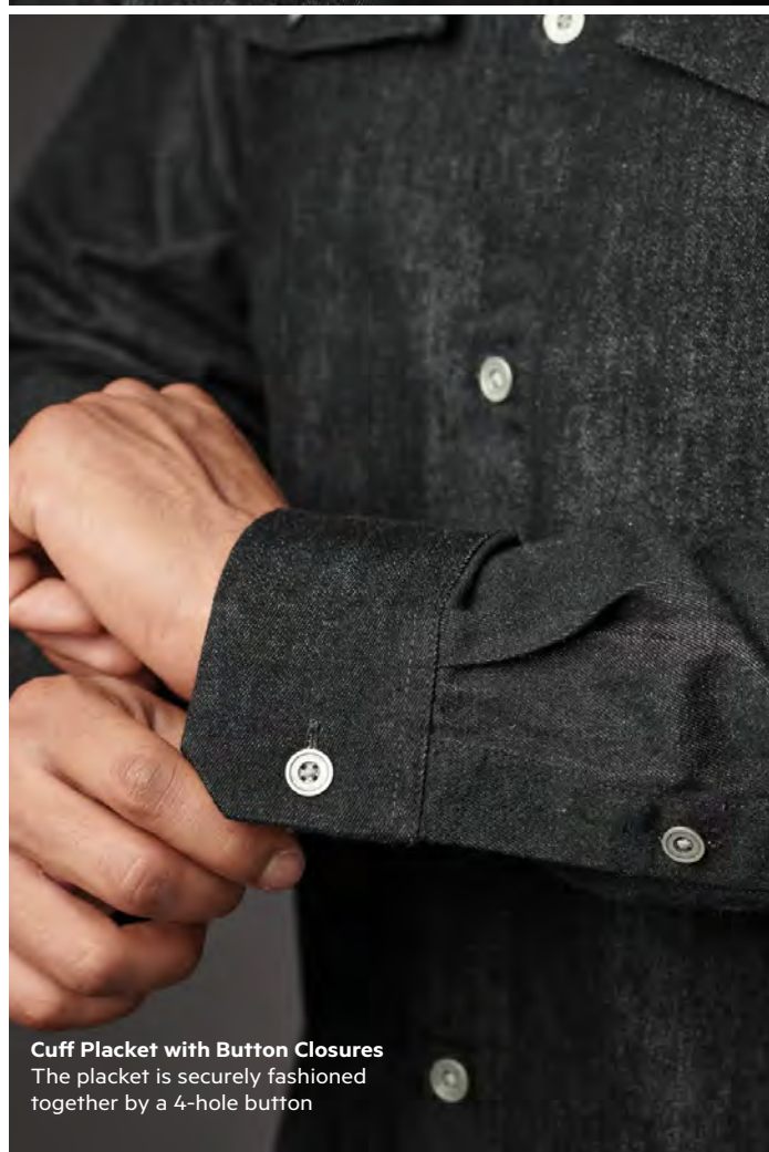
Cuff Placket with Button Closures The placket is securely fashioned together by a 4-hole button