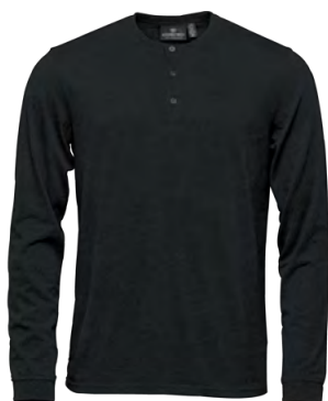
M'S &amp; W'S: BLACK