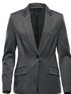
W'S: GRAPHITE HEATHER