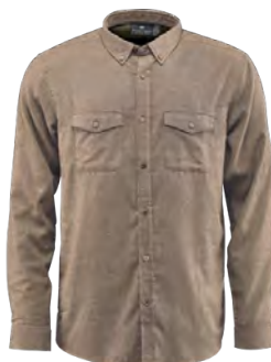
M'S &amp; W'S: STONE