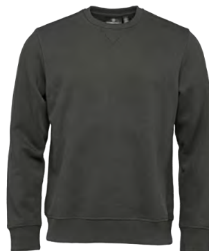
M'S &amp; W'S: PEAT