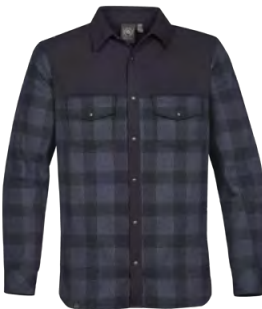
M'S & W'S: NAVY PLAID