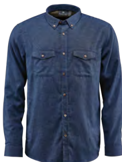
M'S &amp; W'S: NAVY