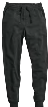
M'S & W'S: BLACK