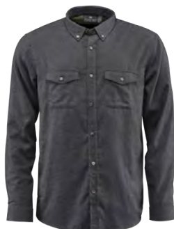
M'S &amp; W'S: CHARCOAL