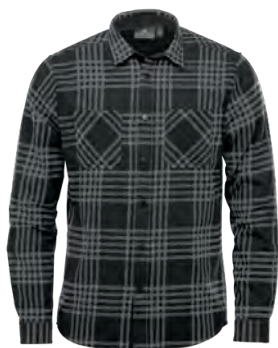
M'S &amp; W'S: CARBON/BLACK