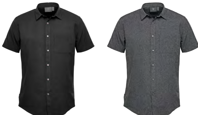
M'S & W'S: BLACK