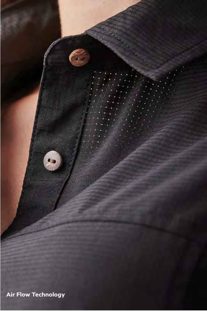
Air Flow Technology