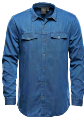
M'S &amp; W'S: LIGHT DENIM