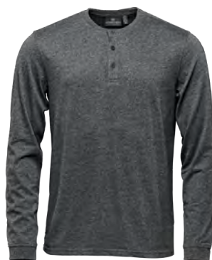
M'S &amp; W'S: GRAPHITE HEATHER