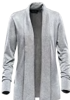
W'S: GREY HEATHER