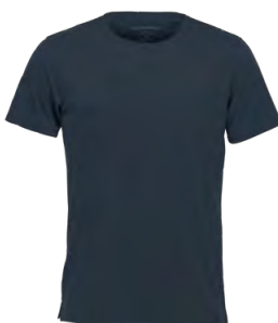
M'S & W'S: NAVY